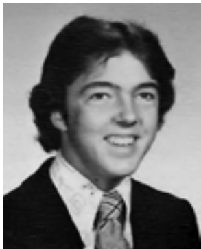
LHS Class of 1975