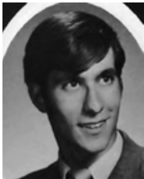
LHS Class of 1971