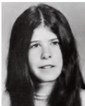
LHS Class of 1973