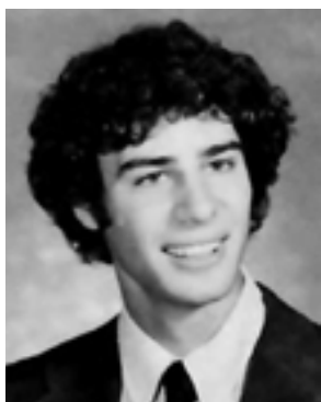
LHS Class of 1979