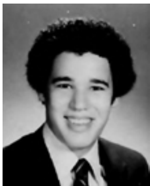
LHS Class of 1980