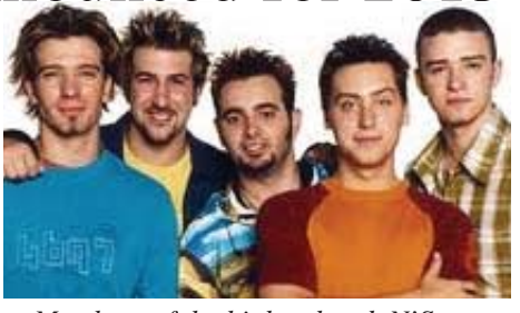
Members of the hit boy band, N'Sync. an inside source. A list and description of some of the new additions goes as follows: 1. Sock Puppet Performance

Mr. Stern would not disclose any additional information regarding the new electives, but further details were leaked from