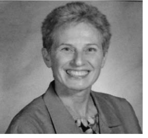
How long have you worked at LHS and what classes have you taught?

I have worked at LHS for 19 years, and have taught all levels of algebra, pre-calculus and calculus. I have also taught HSPA math and basic math skills.