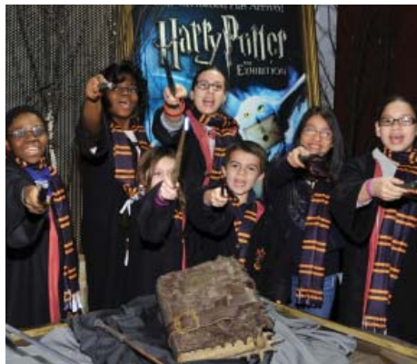
The Harry Potter Exhibition in New York

All witches and wizards are sorted into their respective houses (Gryffindor, Hufflepuff, Ravenclaw, and Slytherin) as they collect house points and vie for the elusive House Cup. Practicing spells, dueling other Hogwarts students, brewing various potions, and exploring Diagon Alley are all part of a day’s work on Pottermore!