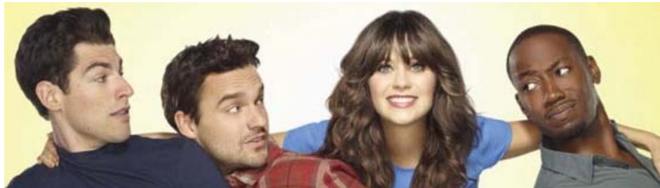
The New Girl Cast: Max Greenfield, Jake Johnson, Zooey Deschanel, Lamorne Morris