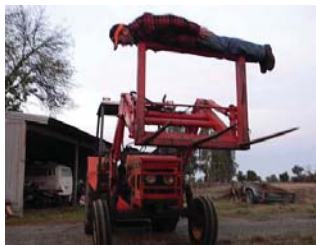
Planking on a tractor.