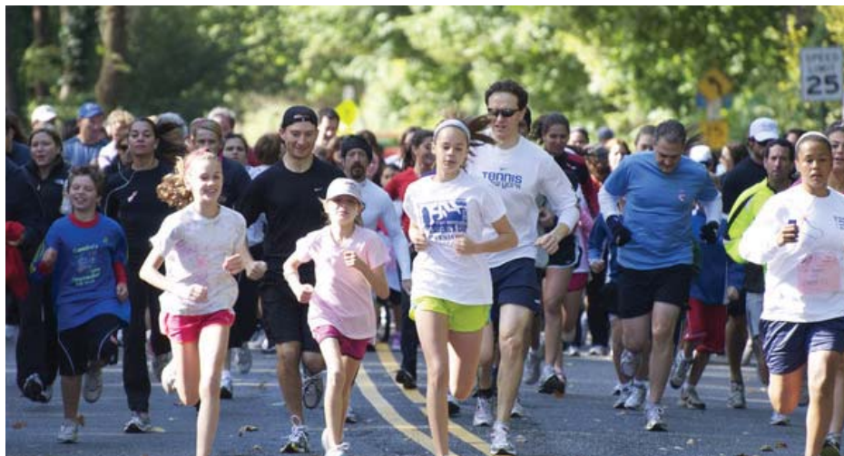
Livingston residents participated in 2010's Go Pink! 5K Run/Walk at South Mountain Reservation.